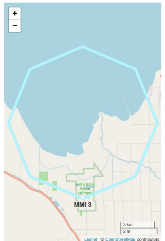
Figure 2. Polygons show the largest contours of estimated shaking intensity. Shaking of MMI 3 or less is often not felt. Star shows the ANSS earthquake epicenter.

Report created 2025-04-10 19:58:17 (Pacific)