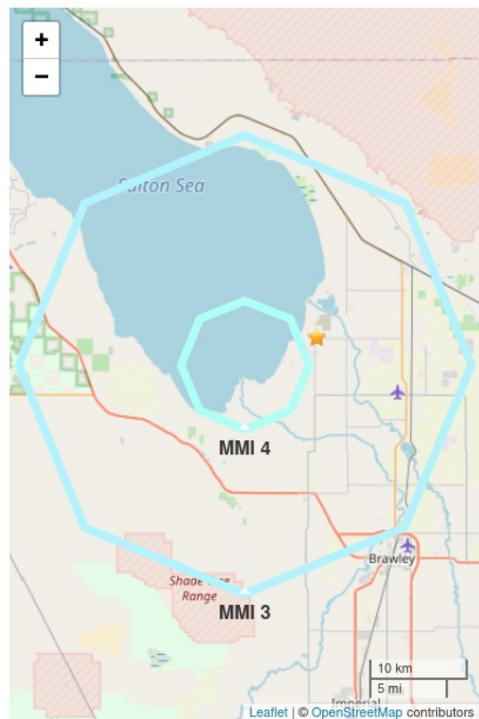
Figure 2. Polygons show the largest contours of estimated shaking intensity. Shaking of MMI 3 or less is often not felt. Star shows the ANSS earthquake epicenter.

Report created 2025-04-10 05:54:31 (Pacific)