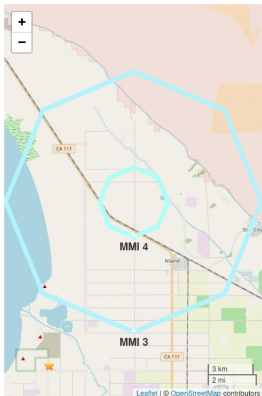
Figure 2. Polygons show the largest contours of estimated shaking intensity. Shaking of MMI 3 or less is often not felt. Star shows the ANSS earthquake epicenter.