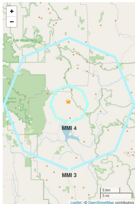
Figure 2. Polygons show the largest contours of estimated shaking intensity. Shaking of MMI 3 or less is often not felt. Star shows the ANSS earthquake epicenter.