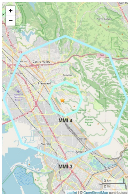
Figure 2. Polygons show the largest contours of estimated shaking intensity. Shaking of MMI 3 or less is often not felt. Star shows the ANSS earthquake epicenter.