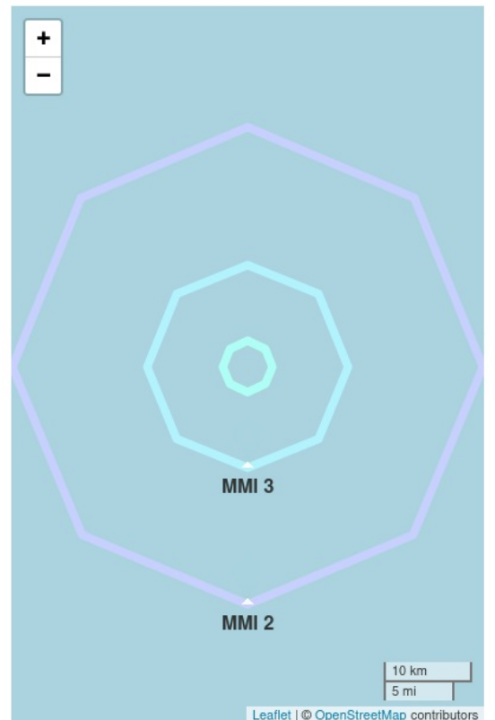
Figure 2. Polygons show shaking intensity contours for the peak magnitude estimate. Shaking of MMI 3 or less is often not felt. ANSS earthquake epicenter not available.

Report created 2024-12-20 15:24:06 (Pacific)