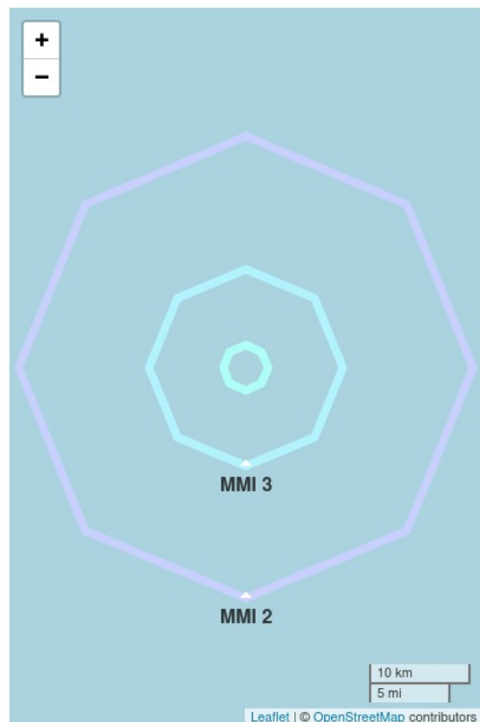
Figure 2. Polygons show shaking intensity contours for the peak magnitude estimate. Shaking of MMI 3 or less is often not felt. ANSS earthquake epicenter not available.

Report created 2024-12-20 05:14:34 (Pacific)