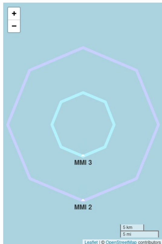
Figure 2. Polygons show shaking intensity contours for the peak magnitude estimate. Shaking of MMI 3 or less is often not felt. ANSS earthquake epicenter not available.