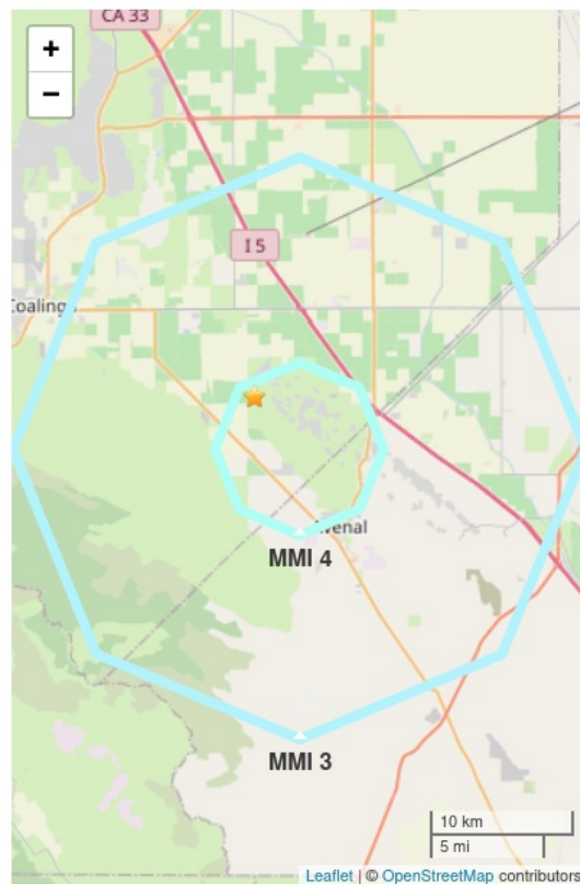
Figure 2. Polygons show shaking intensity contours for the peak magnitude estimate. Shaking of MMI 3 or less is often not felt. Star shows the ANSS earthquake epicenter.

Report created 2024-10-01 17:55:50 (Pacific)