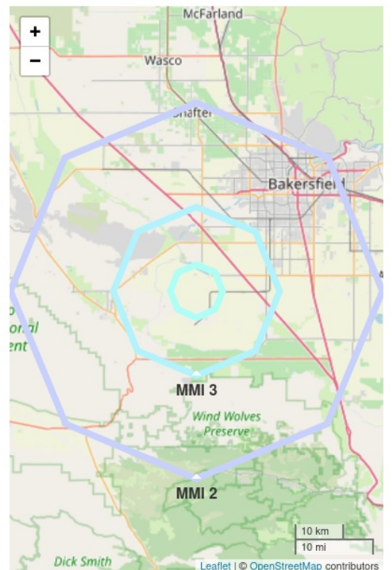
Figure 2. Polygons show shaking intensity contours for the peak magnitude estimate. Shaking of MMI 3 or less is often not felt. ANSS earthquake epicenter not available.

Report created 2024-08-07 00:16:30 (Pacific)