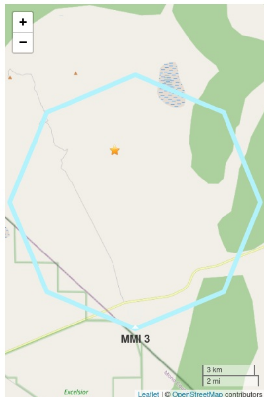
Figure 2. Polygons show shaking intensity contours for the peak magnitude estimate. Shaking of MMI 3 or less is often not felt. Star shows the ANSS earthquake epicenter.