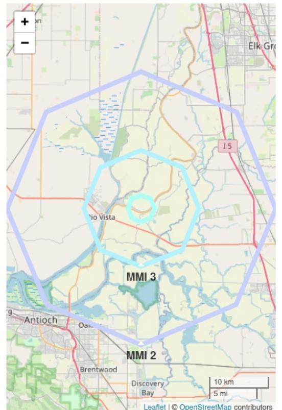
Figure 2. Polygons show shaking intensity contours for the peak magnitude estimate. Shaking of MMI 3 or less is often not felt. ANSS earthquake epicenter not available.

Report created 2023-10-18 19:09:11 (Pacific)