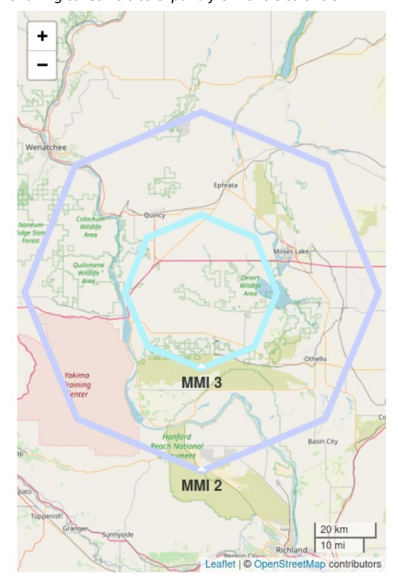
Figure 2. Polygons show shaking intensity contours for the peak magnitude estimate. Shaking of MMI 3 or less is often not felt. ANSS earthquake epicenter not available.