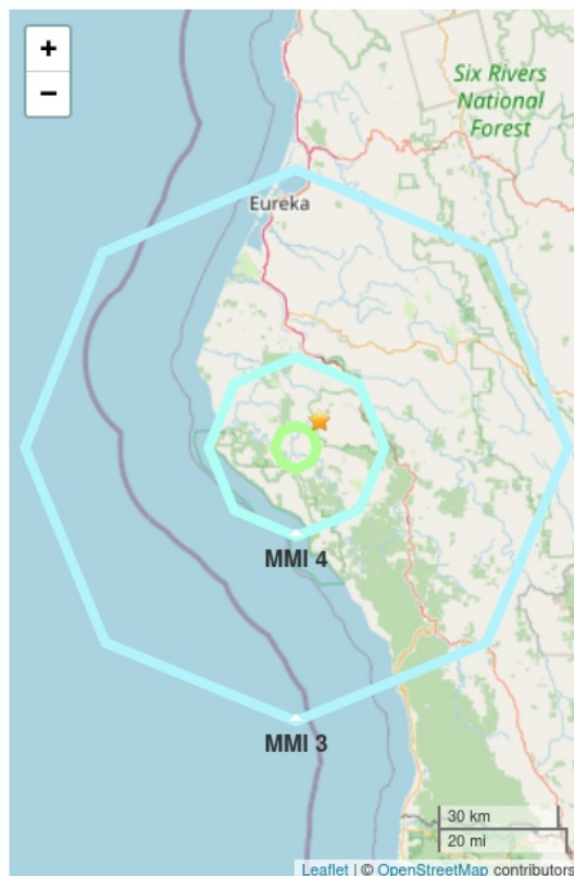
Figure 2. Polygons show shaking intensity contours for the peak magnitude estimate. Shaking of MMI 3 or less is often not felt. Star shows the ANSS earthquake epicenter.

Report created 2023-10-16 03:26:02 (Pacific)