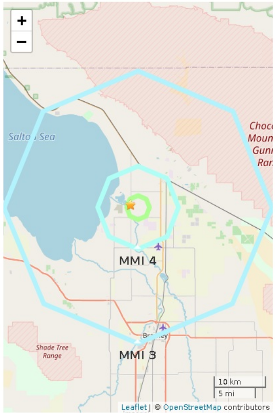
Figure 2. Polygons show shaking intensity contours for the peak magnitude estimate. Shaking of MMI 3 or less is often not felt. Star shows the ANSS earthquake epicenter.