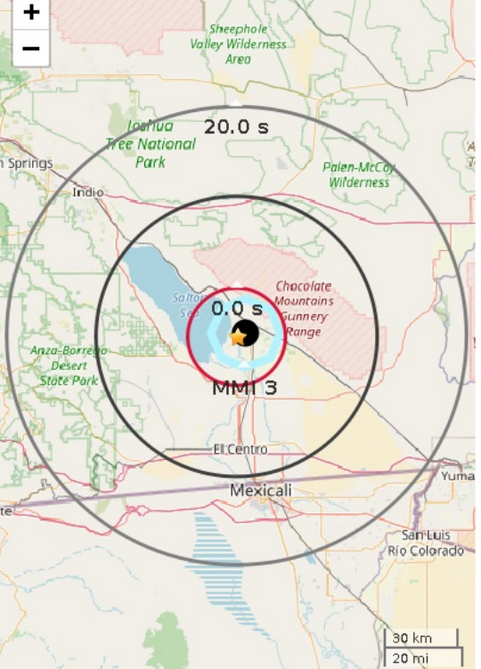
Figure 1. ShakeAlert initial earthquake location (black dot). Star is ANSS earthquake epicenter. Polygon approximates the outer range for felt ground motion. If shown, red circle is front of peak shaking when the message was released ***. Shaking takes 10 s to expand from circle to circle.