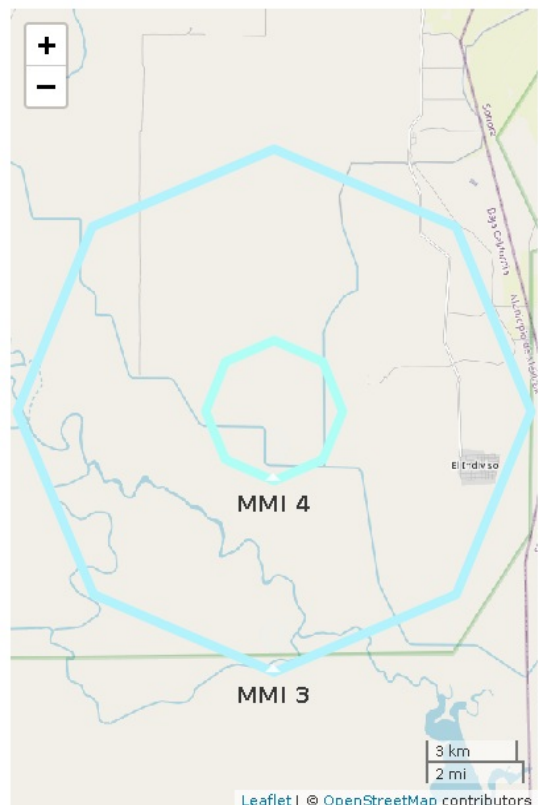
Figure 2. Polygons show shaking intensity contours for the peak magnitude estimate. Shaking of MMI 3 or less is often not felt. Star shows the ANSS earthquake epicenter.