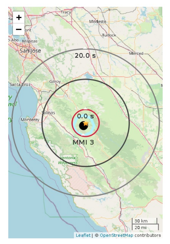
Figure 1. ShakeAlert initial earthquake location (black dot). Star is ANSS earthquake epicenter. Polygon approximates the outer range for felt ground motion. If shown, red circle is front of peak shaking when the message was released***. Shaking takes 10 s to expand from circle to circle.

This information is provisional and subject to revision. It is being provided to meet the need for timely best science. The information has not received final approval by the U.S. Geological Survey (USGS) and is provided on the condition that neither the USGS nor the U.S. Government shall be held liable for any damages resulting from the authorized or unauthorized use of the information.