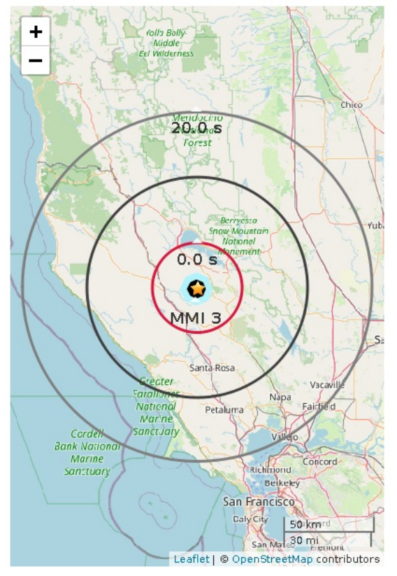
Figure 1. ShakeAlert initial earthquake location (black dot). Star is ANSS earthquake epicenter. Polygon approximates the outer range for felt ground motion. If shown, red circle is front of peak shaking when the message was released***. Shaking takes 10 s to expand from circle to circle.

To learn more about ShakeAlert<sup>®</sup>, visit www.shakealert.org/FAQ