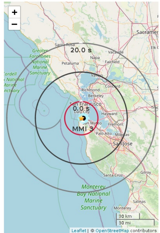
Figure 1. ShakeAlert initial earthquake location (black dot). Star is ANSS earthquake epicenter. Polygon approximates the outer range for felt ground motion. If shown, red circle is front of peak shaking when the message was released***. Shaking takes 10 s to expand from circle to circle.

To learn more about ShakeAlert®, visit www.shakealert.org/FAQ