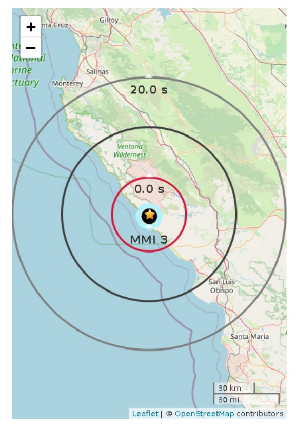
Figure 1. ShakeAlert initial earthquake location (black dot). Star is ANSS earthquake epicenter. Polygon approximates the outer range for felt ground motion. If shown, red circle is front of peak shaking when the message was released***. Shaking takes 10 s to expand from circle to circle.