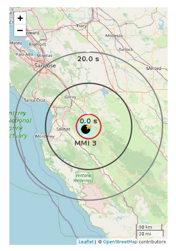
Figure 1. ShakeAlert initial earthquake location (black dot). Star is ANSS earthquake epicenter. Polygon approximates the outer range for felt ground motion. If shown, red circle is front of peak shaking when the message was released***. Shaking takes 10 s to expand from circle to circle.

This information is provisional and subject to revision. It is being provided to meet the need for timely best science. The information has not received final approval by the U.S. Geological Survey (USGS) and is provided on the condition that neither the USGS nor the U.S. Government shall be held liable for any damages resulting from the authorized or unauthorized use of the information.