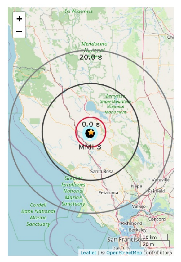
Figure 1. ShakeAlert initial earthquake location (black dot). Star is ANSS earthquake epicenter. Polygon approximates the outer range for felt ground motion. If shown, red circle is front of peak shaking when the message was released***. Shaking takes 10 s to expand from circle to circle.

This information is provisional and subject to revision. It is being provided to meet the need for timely best science. The information has not received final approval by the U.S. Geological Survey (USGS) and is provided on the condition that neither the USGS nor the U.S. Government shall be held liable for any damages resulting from the authorized or unauthorized use of the information.