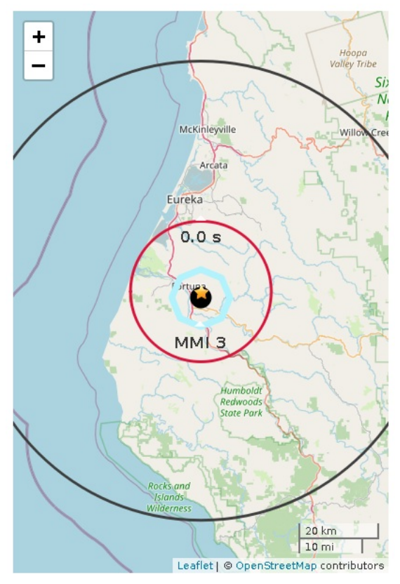
Figure 1. ShakeAlert initial earthquake location (black dot). Star is ANSS earthquake epicenter. Polygon approximates the outer range for felt ground motion. If shown, red circle is front of peak shaking when the message was released***. Shaking takes 10 s to expand from circle to circle.