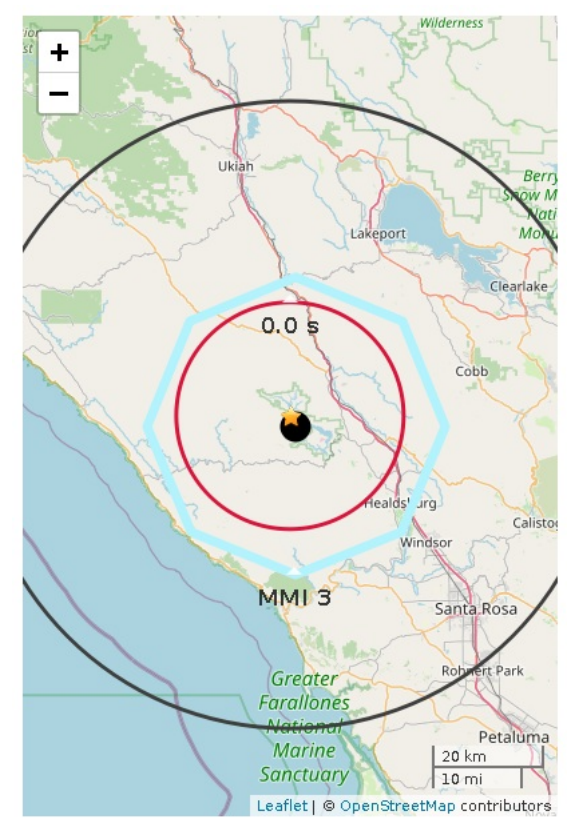
Figure 1. ShakeAlert initial earthquake location (black dot). Star is ANSS earthquake epicenter. Polygon approximates the outer range for felt ground motion. If shown, red circle is front of peak shaking when the message was released***. Shaking takes 10 s to expand from circle to circle.

This information is provisional and subject to revision. It is being provided to meet the need for timely best science. The information has not received final approval by the U.S. Geological Survey (USGS) and is provided on the condition that neither the USGS nor the U.S. Government shall be held liable for any damages resulting from the authorized or unauthorized use of the information.