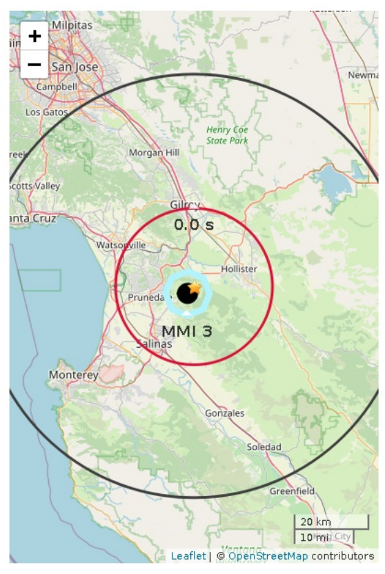
Figure 1. ShakeAlert initial earthquake location (black dot). Star is ANSS earthquake epicenter. Polygon approximates the outer range for felt ground motion. If shown, red circle is front of peak shaking when the message was released *** Shaking takes 10 s to expand from circle to circle.