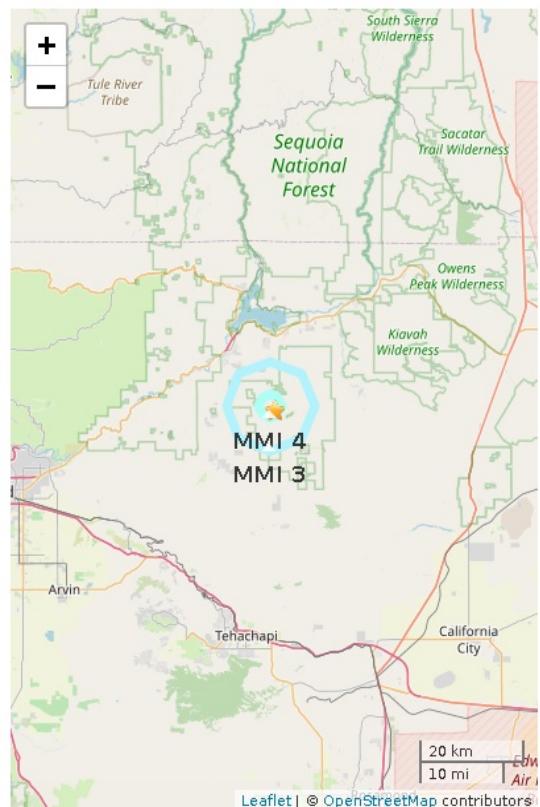
Figure 2. Polygons show shaking intensity contours for the peak magnitude estimate. Shaking of MMI 3 or less is often not felt. Star shows the ANSS earthquake epicenter.

Report created 2022-12-07 06:18:36 (Pacific)