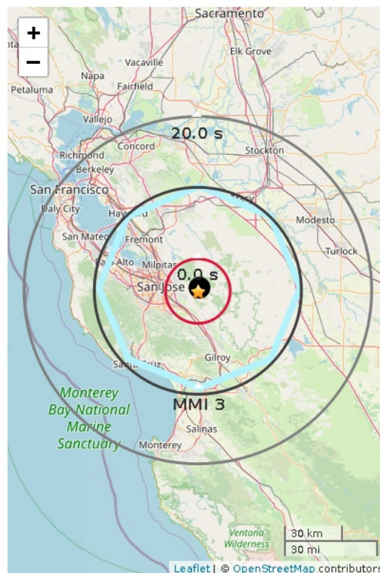
Figure 1. ShakeAlert initial earthquake location (black dot). Star is ANSS earthquake epicenter. Polygon approximates the outer range for felt ground motion. If shown, red circle is front of peak shaking when the message was released***. Shaking takes 10 s to expand from circle to circle.

To learn more about ShakeAlert®, visit www.shakealert.org/FAQ