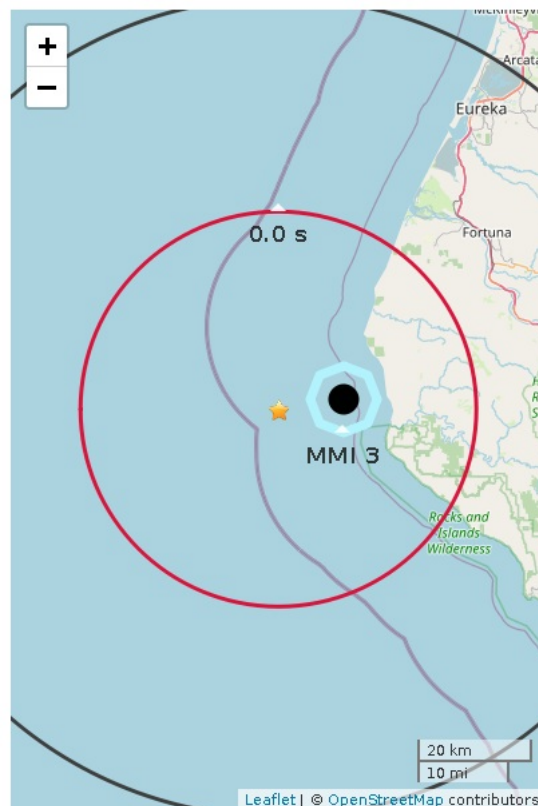
Figure 1. ShakeAlert initial earthquake location (black dot). Star is ANSS earthquake epicenter. Polygon approximates the outer range for felt ground motion. If shown, red circle is front of peak shaking when the message was released***. Shaking takes 10 s to expand from circle to circle.

To learn more about ShakeAlert®, visit www.shakealert.org/FAQ