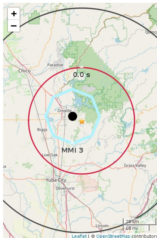
Figure 1. ShakeAlert initial earthquake location (black dot). Star is ANSS earthquake epicenter. Polygon approximates the outer range for felt ground motion. If shown, red circle is front of peak shaking when the message was released***. Shaking takes 10 s to expand from circle to circle.

To learn more about ShakeAlert®, visit www.shakealert.org/FAQ