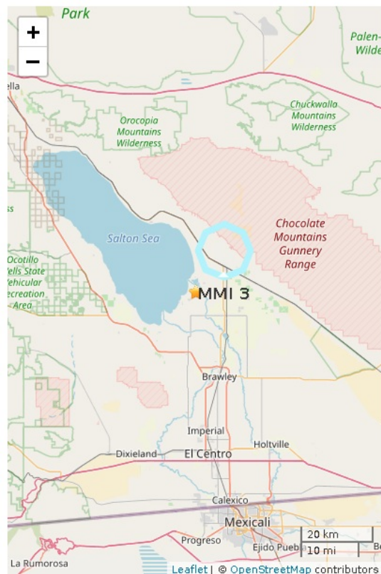
Figure 2. Polygons show shaking intensity contours for the peak magnitude estimate. Shaking of MMI 3 or less is often not felt. Star shows the ANSS earthquake epicenter.

Report created 2022-06-28 21:24:45 (Pacific)