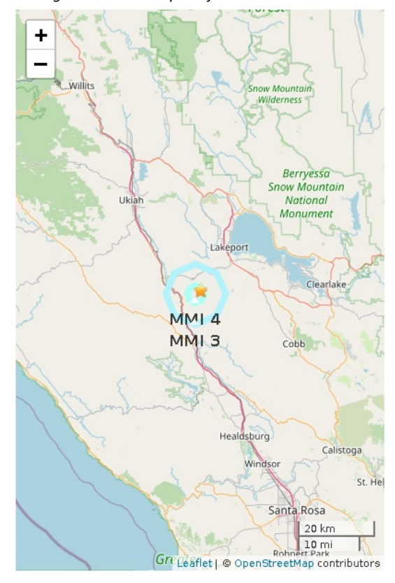
Figure 2. Polygons show shaking intensity contours for the peak magnitude estimate. Shaking of MMI 3 or less is often not felt. Star shows the ANSS earthquake epicenter.