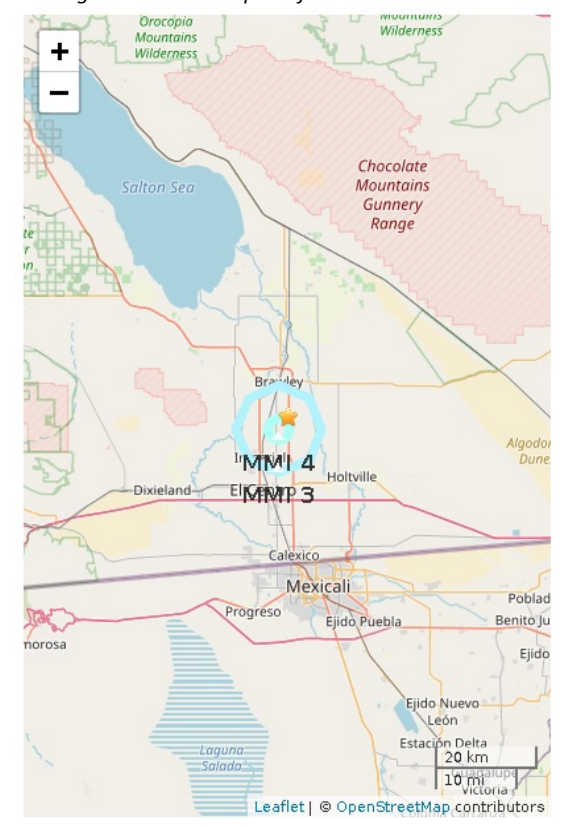
Figure 2. Polygons show shaking intensity contours for the peak magnitude estimate. Shaking of MMI 3 or less is often not felt. Star shows the ANSS earthquake epicenter.