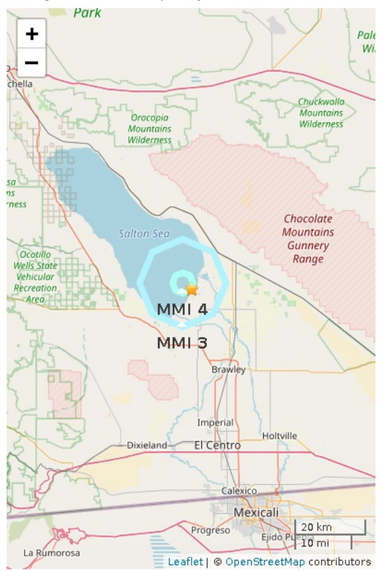
Figure 2. Polygons show shaking intensity contours for the peak magnitude estimate. Shaking of MMI 3 or less is often not felt. Star shows the ANSS earthquake epicenter.

Figure 1. ShakeAlert initial earthquake location (black dot). Star is ANSS earthquake epicenter. Polygon approximates the outer range for felt ground motion. If shown, red circle is front of peak shaking when the message was released***. Shaking takes 10 s to expand from circle to circle.