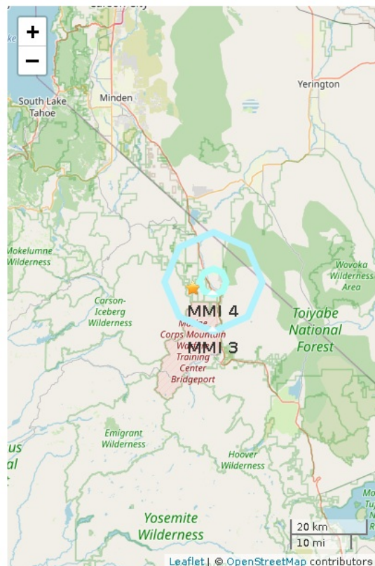
Figure 2. Polygons show shaking intensity contours for the peak magnitude estimate. Shaking of MMI 3 or less is often not felt. Star shows the ANSS earthquake epicenter.

Report created 2022-03-17 21:56:34 (Pacific)