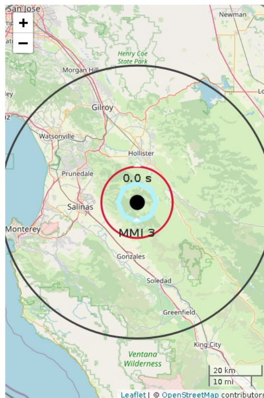
Figure 1. ShakeAlert initial earthquake location (black dot). ANSS earthquake epicenter not available. Polygon approximates outer range for felt ground motion. If shown, red circle is front of peak shaking when the message was released***. Shaking takes 10 s to expand from circle to circle.

To learn more about ShakeAlert®, visit www.shakealert.org/FAQ