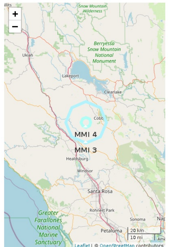
Figure 2. Polygons show shaking intensity contours for the peak magnitude estimate. Shaking of MMI 3 or less is often not felt. ANSS earthquake epicenter not available.

Report created 2022-02-08 15:21:07 (Pacific)