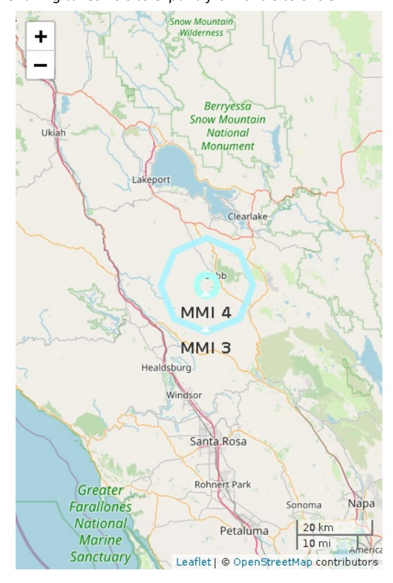
Figure 2. Polygons show shaking intensity contours for the peak magnitude estimate. Shaking of MMI 3 or less is often not felt. ANSS earthquake epicenter not available.