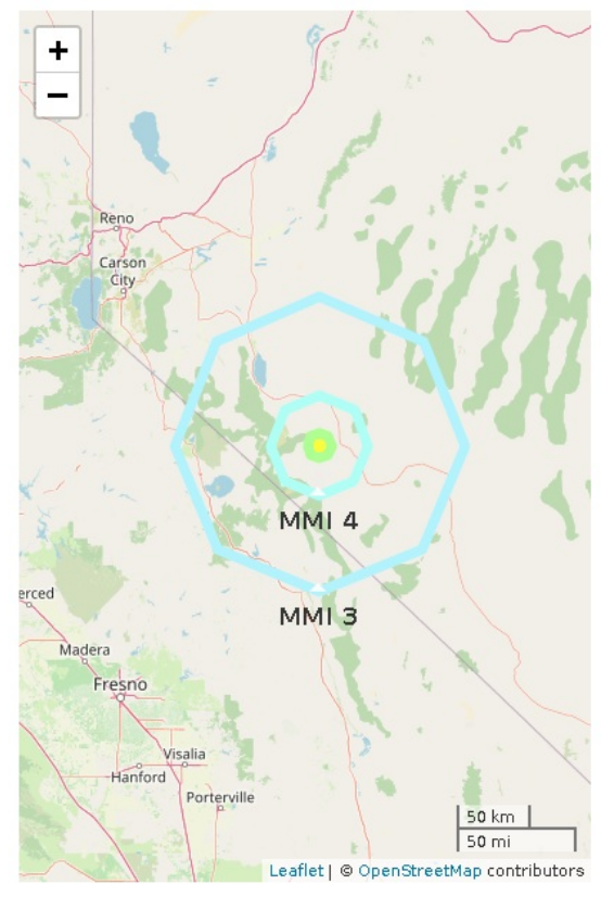
Figure 2. Polygons show shaking intensity contours for the peak magnitude estimate. Shaking of MMI 3 or less is often not felt. ANSS earthquake epicenter not available.