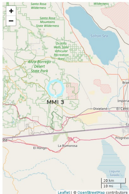
Figure 2. Polygons show shaking intensity contours for the peak magnitude estimate. Shaking of MMI 3 or less is often not felt. ANSS earthquake epicenter not available.