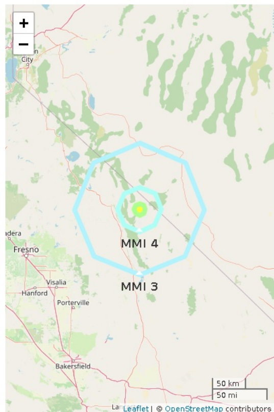
Figure 2. Polygons show shaking intensity contours for the peak magnitude estimate. Shaking of MMI 3 or less is often not felt. ANSS earthquake epicenter not available.