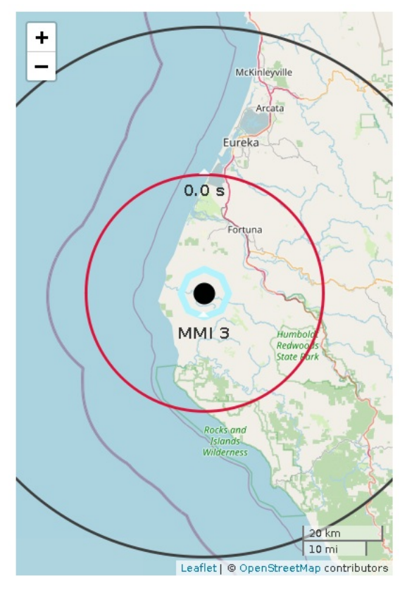
Figure 1. ShakeAlert initial earthquake location (black dot). ANSS earthquake epicenter not available. Polygon approximates outer range for felt ground motion. If shown, red circle is front of peak shaking when the message was released***. Shaking takes 10 s to expand from circle to circle.

This information is provisional and subject to revision. It is being provided to meet the need for timely best science. The information has not received final approval by the U.S. Geological Survey (USGS) and is provided on the condition that neither the USGS nor the U.S. Government shall be held liable for any damages resulting from the authorized or unauthorized use of the information.