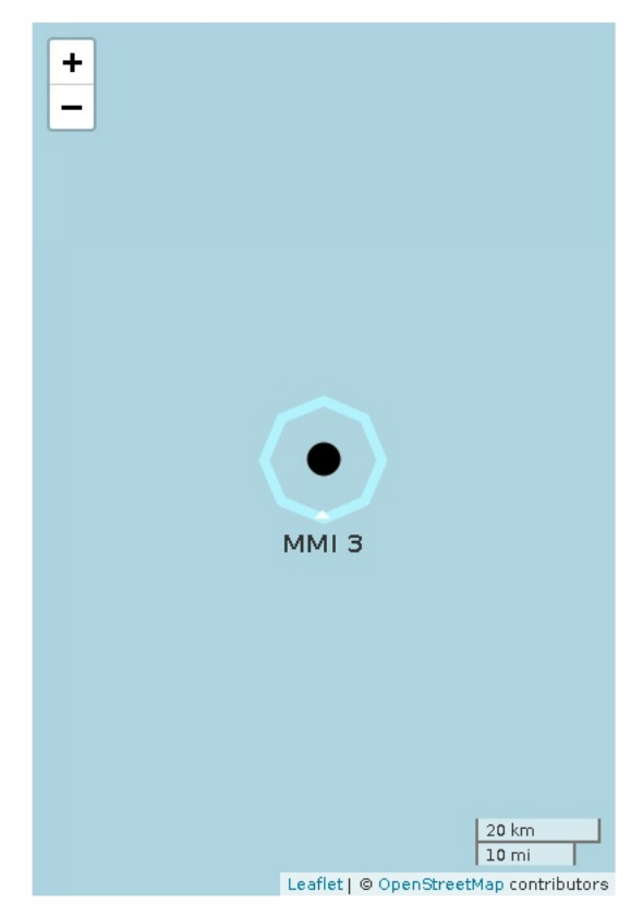
Figure 1. ShakeAlert initial earthquake location (black dot). ANSS earthquake epicenter not available. Polygon approximates outer range for felt ground motion. If shown, red circle is front of peak shaking when the message was released***. Shaking takes 10 s to expand from circle to circle.