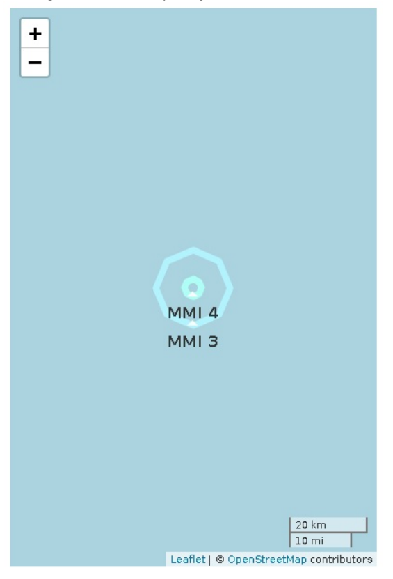
Figure 2. Polygons show shaking intensity contours for the peak magnitude estimate. Shaking of MMI 3 or less is often not felt. ANSS earthquake epicenter not available.

Figure 1. ShakeAlert initial earthquake location (black dot). ANSS earthquake epicenter not available. Polygon approximates outer range for felt ground motion. If shown, red circle is front of peak shaking when the message was released***. Shaking takes 10 s to expand from circle to circle.