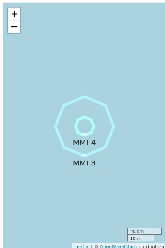
Figure 2. Polygons show shaking intensity contours for the peak magnitude estimate. Shaking of MMI 3 or less is often not felt. ANSS earthquake epicenter not available.