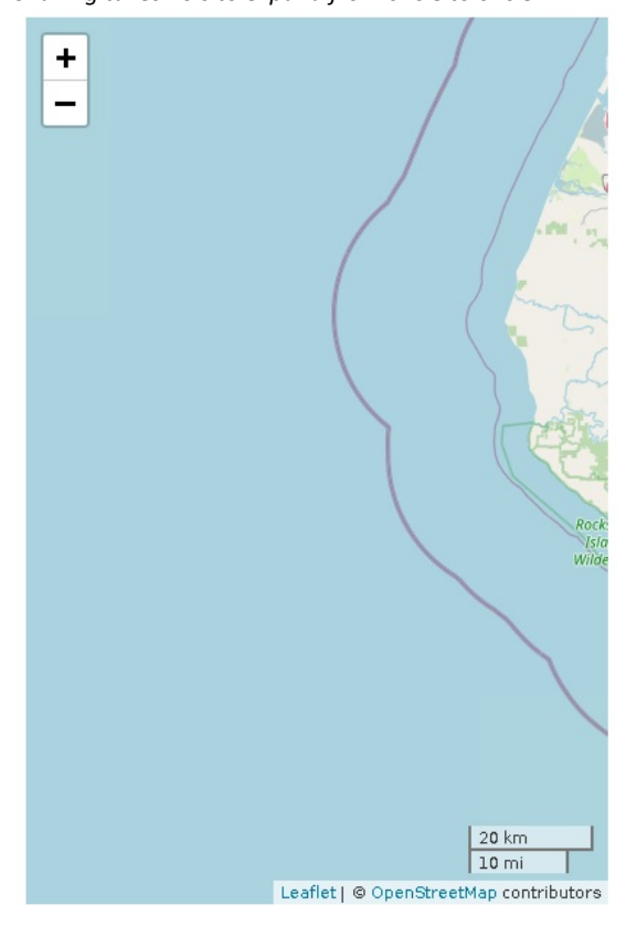
Figure 2. Polygons show shaking intensity contours for the peak magnitude estimate. Shaking of MMI 3 or less is often not felt. ANSS earthquake epicenter not available.