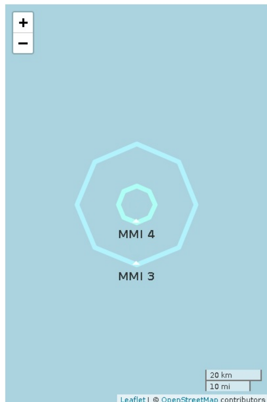
Figure 2. Polygons show shaking intensity contours for the peak magnitude estimate. Shaking of MMI 3 or less is often not felt. ANSS earthquake epicenter not available.