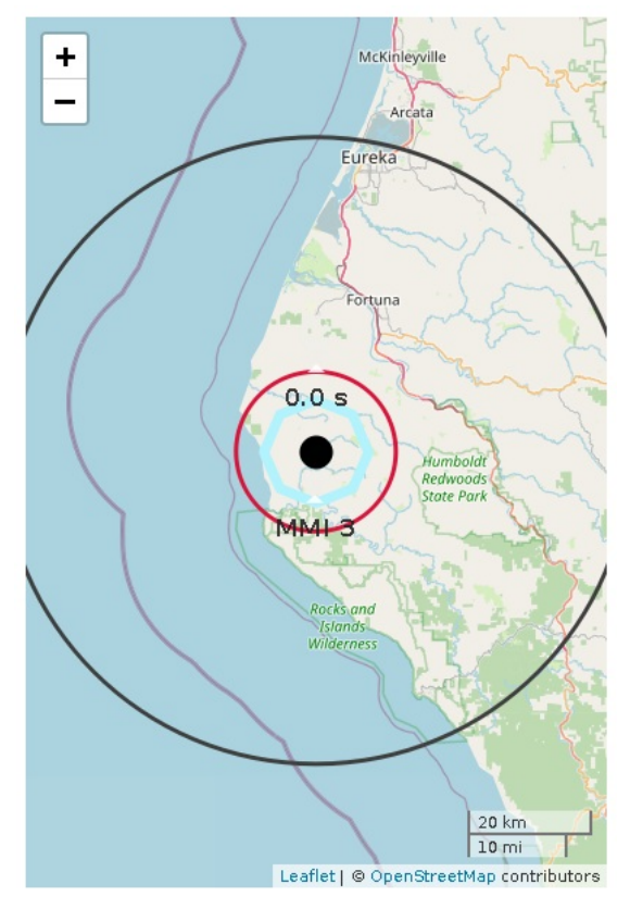
Figure 1. ShakeAlert initial earthquake location (black dot). ANSS earthquake epicenter not available. Polygon approximates outer range for felt ground motion. If shown, red circle is front of peak shaking when the message was released***. Shaking takes 10 s to expand from circle to circle.

This information is provisional and subject to revision. It is being provided to meet the need for timely best science. The information has not received final approval by the U.S. Geological Survey (USGS) and is provided on the condition that neither the USGS nor the U.S. Government shall be held liable for any damages resulting from the authorized or unauthorized use of the information.