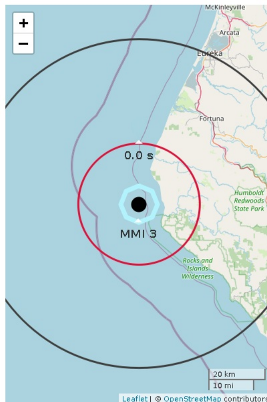
Figure 1. ShakeAlert initial earthquake location (black dot). ANSS earthquake epicenter not available. Polygon approximates outer range for felt ground motion. If shown, red circle is front of peak shaking when the message was released***. Shaking takes 10 s to expand from circle to circle.

This information is provisional and subject to revision. It is being provided to meet the need for timely best science. The information has not received final approval by the U.S. Geological Survey (USGS) and is provided on the condition that neither the USGS nor the U.S. Government shall be held liable for any damages resulting from the authorized or unauthorized use of the information.