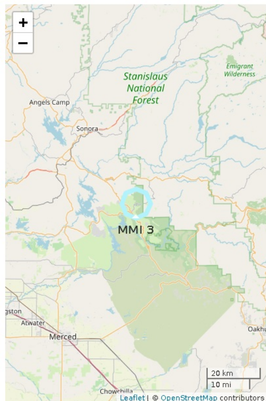
Figure 2. Polygons show shaking intensity contours for the peak magnitude estimate. Shaking of MMI 3 or less is often not felt. ANSS earthquake epicenter not available.

Report created 2021-11-02 09:02:20 (Pacific)