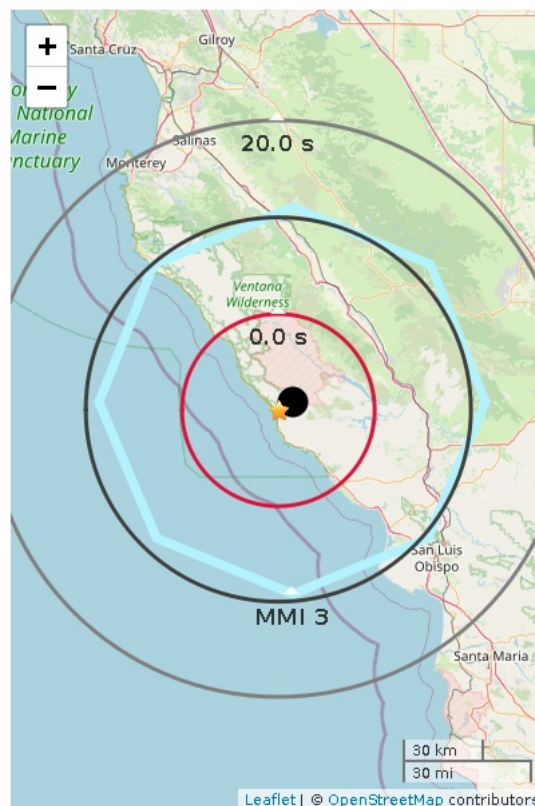
Figure 1. ShakeAlert initial earthquake location (black dot). Star is ANSS earthquake epicenter. Polygon shows estimated MMI 4 shaking intensity area. If shown, red circle is front of peak shaking when the message was released***. Shaking takes 10 s to expand from circle to circle.

To learn more about ShakeAlert®, visit www.shakealert.org/FAQ