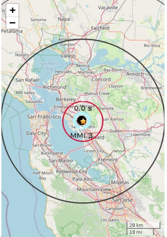
Figure 1. ShakeAlert initial earthquake location (black dot). Star is ANSS earthquake epicenter. Polygon approximates the outer range for felt ground motion. If shown, red circle is front of peak shaking when the message was released*** Shaking takes 10 s to expand from circle to circle.